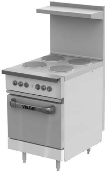
Model EV24S-4FP208 shown with adjustable legs