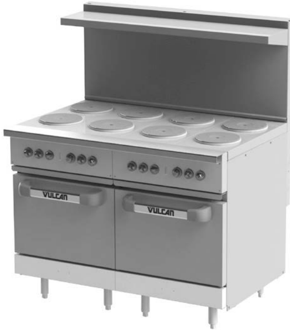
Model EV48SS-8FP208 shown with adjustable legs