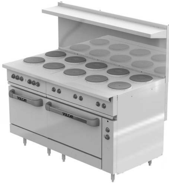
Model EV60SS-10FP208 shown with adjustable legs