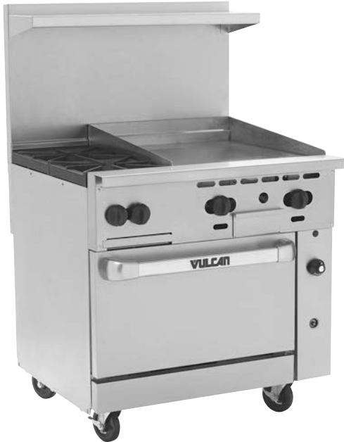
Model 36S-2B24GN (shown with optional casters)