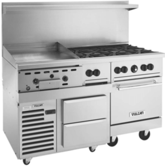
36R shown in a 60" configuration