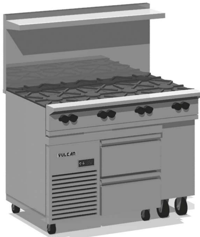
36R in a 48" Setup