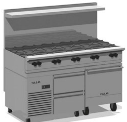
36R in a 60" Setup