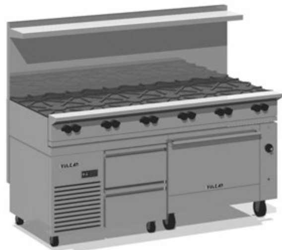
36R in a 72" Setup