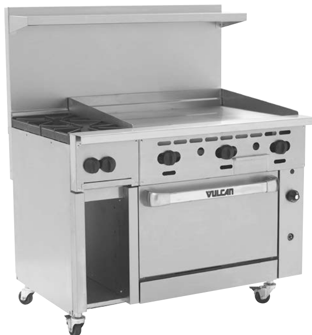
Model 48S-2B36GN (shown with optional casters)