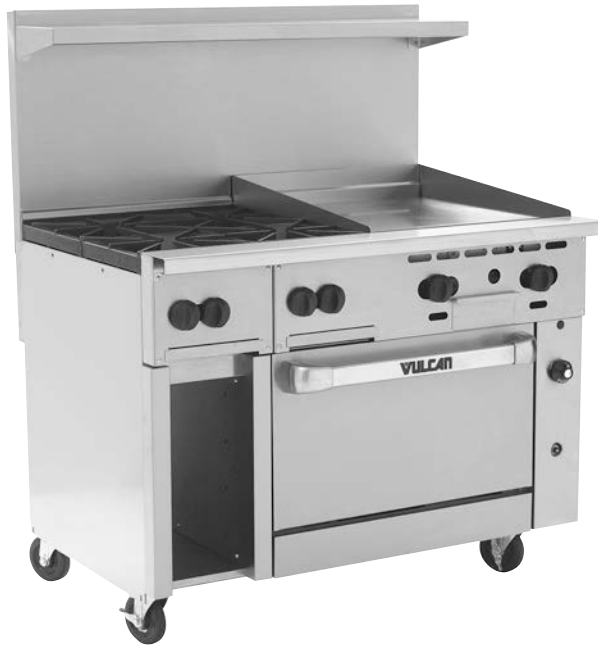
Model 48S-4B24GN (shown with optional casters)