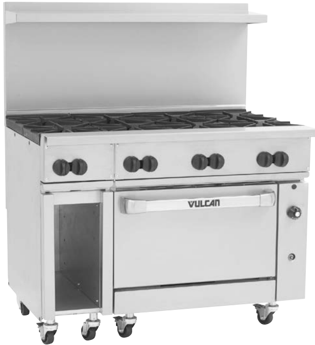
Model 48S-8BN (shown with optional casters)