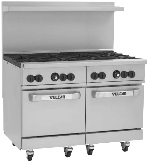
Model 48SS-8BN (shown with optional casters)