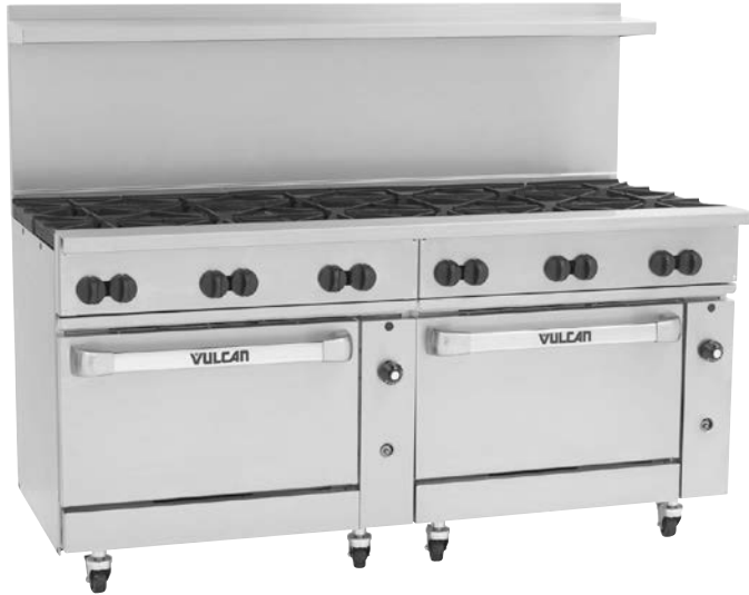
Model 72SC-12BN (shown with optional casters)