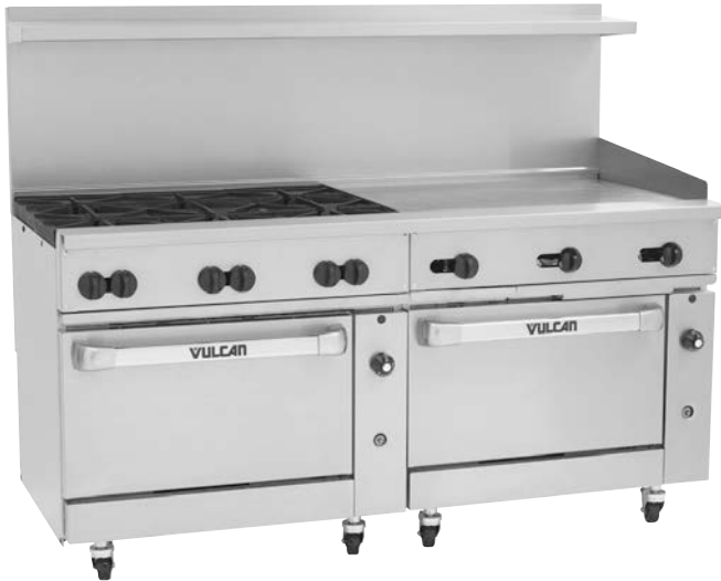
Model 72SC-6B-36G-N (shown with optional casters)