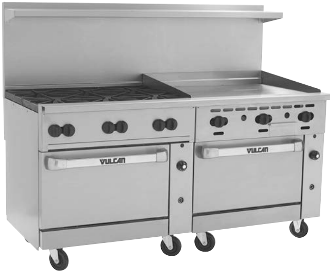
Model 72SS-6B36GN (shown with optional casters)