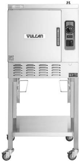
C24EA5-LWE Shown on optional 28" Stand and locking casters