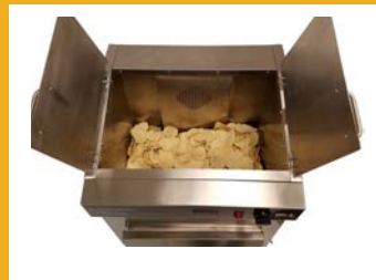
Easy Load Doors