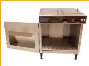
Easy-To-Clean Holding Compartment

This easy to use chip warmer will hold up to 26 gallons of chips and maintain them at an ideal serving temperature. With its all stainless steel construction and easy access holding compartment, it is a breeze to clean and maintain. The digital temperature indicator and adjustable thermostat ensure that the chips are always served at the proper temperature. This warmer utilizes convection heating with a circulating fan to make sure that all of the product gets heated evenly with a range from 90-180 degrees F. The 4" legs make it easy to clean under the unit while the double hinged loading doors make it simple to add chips.