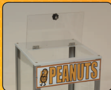
Top-loading for convenience