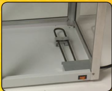
50 watt heating element