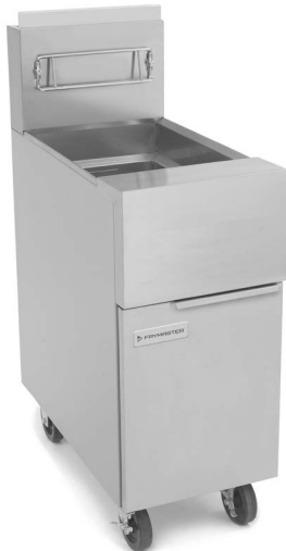
GF40 Shown with casters