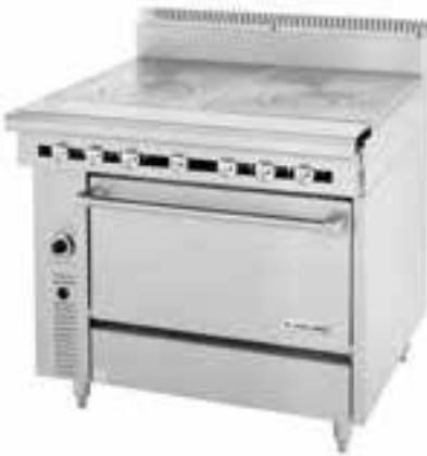
Model C836-10 Range with Two Front-Fired Hot Tops