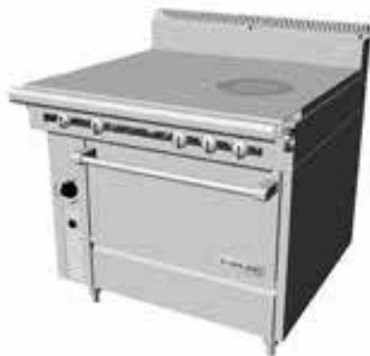
Model C386-11 Range with 18" Front Fired Hot Top & 18" Even Heat Hot Top