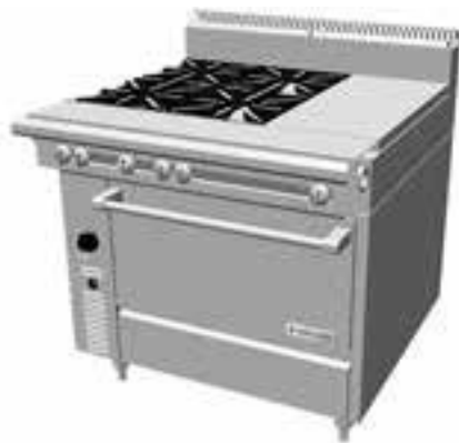
Model C836-14 Range with 2 Open burners & 18" Even Heat Hot Top