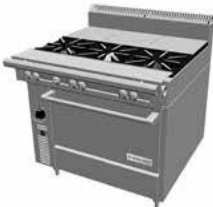
Model C386-15 Range with Three 12" French Tops