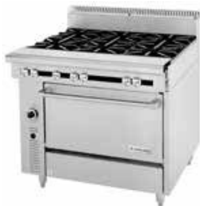
Model C836-6 Range with Six Open Burners