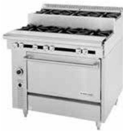
Model C836-6SU Range with 6 Step-Up Open Burners Top