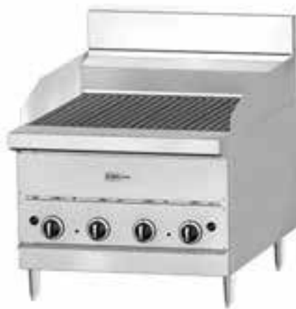
G24-BRL With 4" Legs For Counter Mount