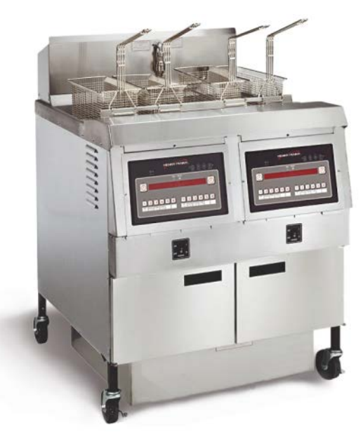
OFG 322 2-well gas open fryer with Computron™ 8000 control

Henny Penny open fryers offer high-volume, integral multi-well frying