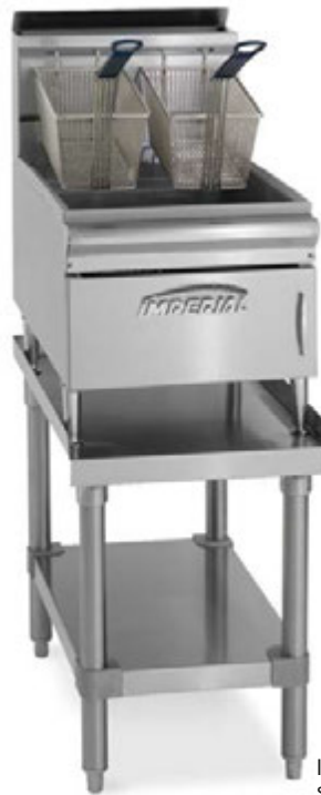
IFST-25 shown with optional stainless steel equipment stand

Robotic welding is precise, virtually eliminating leaks.