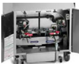
Filter is located under fryers to save valuable space.