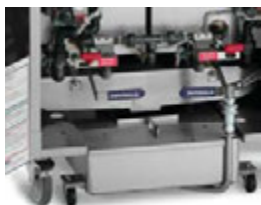
Filter pan is designed for maximum oil return.