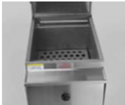
Special stainless steel alloy vessel withstands strong salt concentrations.