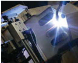
Robotic welding is precise, virtually eliminating leaks.