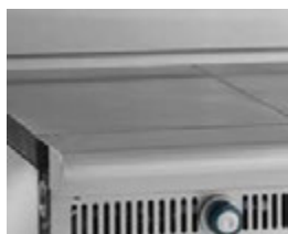
Hot Tops have even heating across surface.