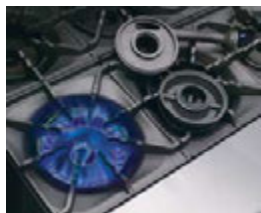
35,000 BTU/hr. (10 KW) anti-clogging, removable burner.

IHR-2-12-XB IHR-2-18-XB IHR-4-24-XB IHR-1HT-12-XB IHR-1HT-18-XB IHR-2HT-24-XB IHR-G12-XB IHR-G18-XB IHR-G24-XB IHR-GT12-XB IHR-GT18-XB IHR-GT24-XB