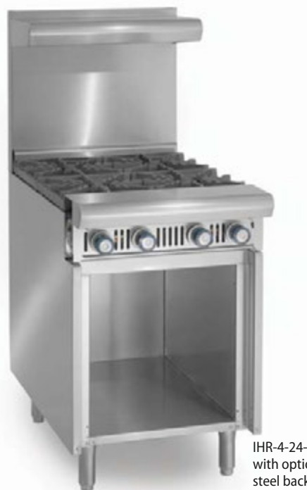
IHR-4-24-XB shown with optional stainless steel backguard and shelf

ADD-A-UNITs - Both floor model (-XB) and modular/countertop (-M) styles are available.