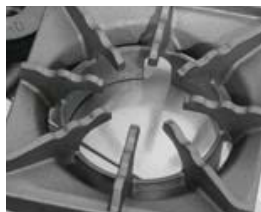
Wavy grates raise pan creating more heat transfer than direct metal-to-metal contact.