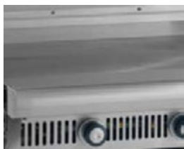
Griddle Tops have "U" shaped burners directly under plate.