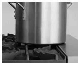
Grates are flush mount to the front ledge for easy sliding across of the entire top surface.