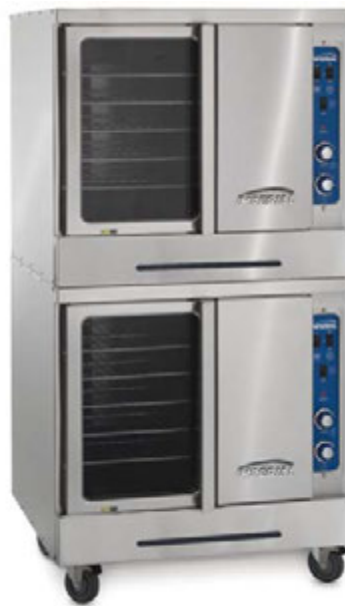
ICV-2 shown with optional casters

Four bearings per door extend the life of the door mechanism.