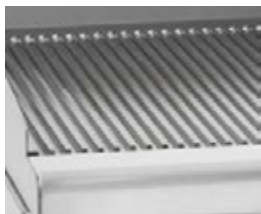
Grooved plate provides attractive char-broiled look.