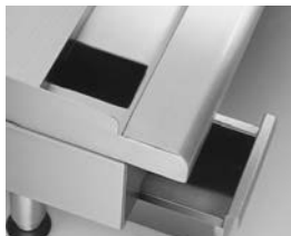
Stainless steel grease gutter and 1 gal. (3.8 L) grease can.