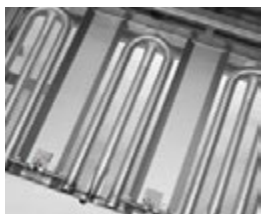
Aeration baffles between burners spread heat across the griddle plate for even heating.