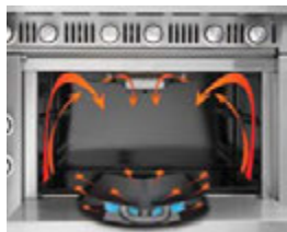
"M" shaped burner for even heating throughout the oven cavity.