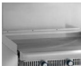
1" (25 mm) thick steel polished griddle plate.