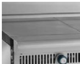
Hot Tops have even heating across surface.