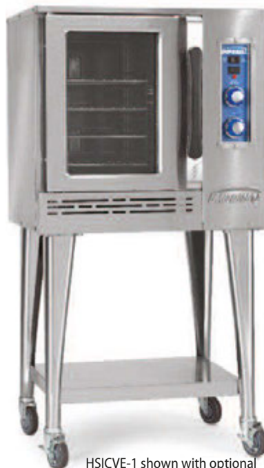
HSICVE-1 shown with optional bottom shelf and casters

Oven interior is porcelainized for easy cleaning.