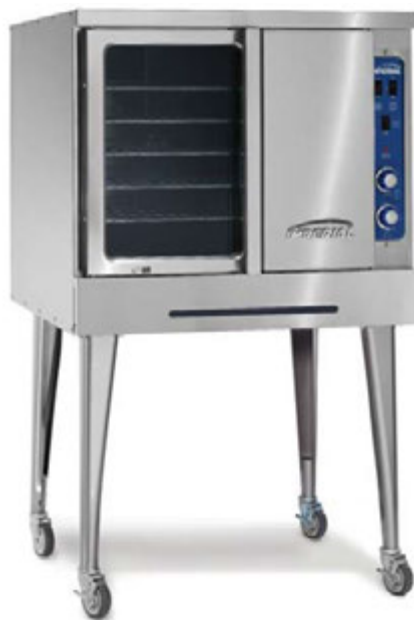
ICVE-1 shown with optional casters

Four bearings per door extend the life of the door mechanism.