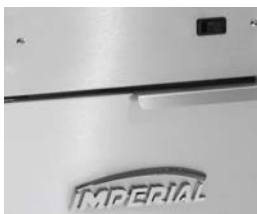
Stainless steel exterior (except back) is easy to clean and has a professional look.