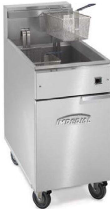
IFS-75-EU shown with optional casters

ELECTRIC ELEMENTS - Elements are located inside the stainless steel frypot, below the fry zone.