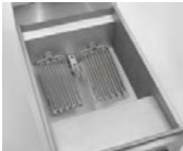
Immersed element models are the lowest cost alternative for electric fryers.