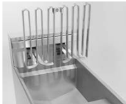
Tilt-up elements provide full access to the frypot for cleaning.