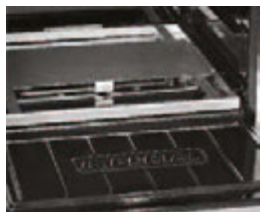
Splatter screen protects the element from spills.