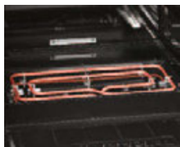
5.3 KW element provides even heating throughout the oven cavity.