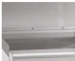
Thick steel polished griddle plate for even heating across the entire surface.

IHR-GT36-E IHR-GT36-E-C IHR-GT36-E-XB IHR-GT36-E-M