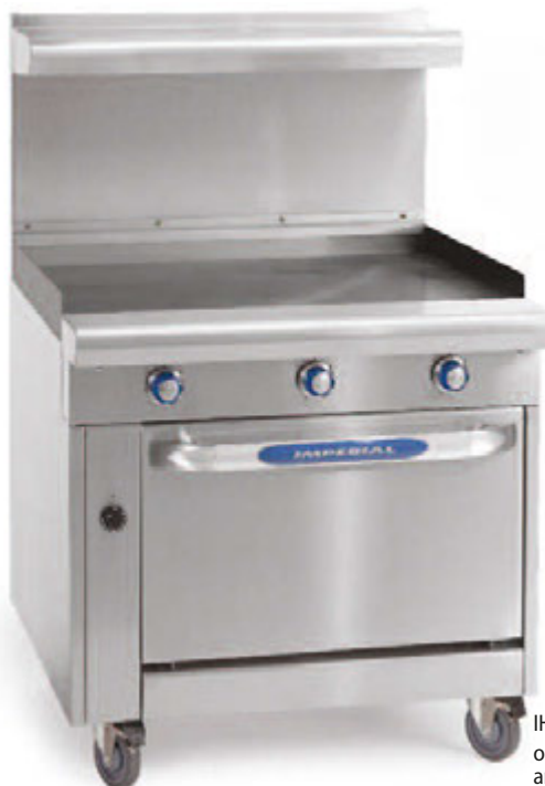
IHR-GT36-E shown with optional SHS-36 shelf and casters

GRIDDLE TOPS - Highly polished griddle plate provide even heat across entire surface.