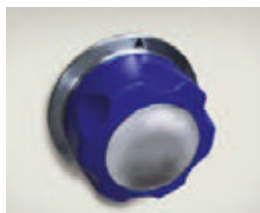
Durable cast aluminum with a Valox™ heat protection grip.