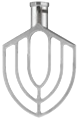
WSM20LMP Aluminum Mixing Paddle