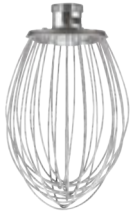
WSM20LW Stainless Steel Chef's Whisk