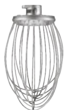
WSM10LW Stainless Steel Chef's Whisk