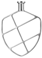
WSM7LMP Stainless Steel Mixing Paddle