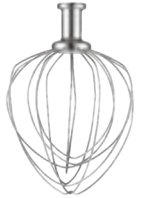
WSM7LW Stainless Steel Chef's Whisk