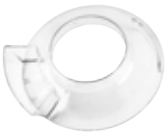
WSM7LSG Splash Guard/Feed Chute