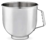
WSM7LBL 7-Quart Stainless Steel Bowl