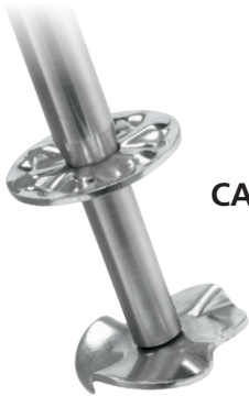
CAC112 Solid Agitator (6 pack)