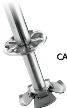
CAC123 Butterfly Agitator (6 pack)