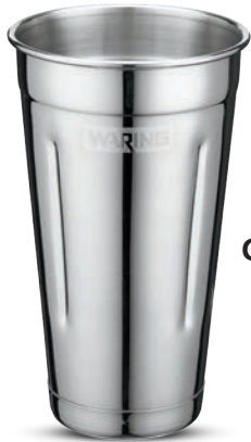
CAC20 Stainless Steel Malt Cup