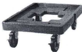
KX9006 comes w/strap