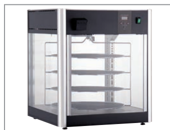
EDM-1K with 4-Tier Round Rack