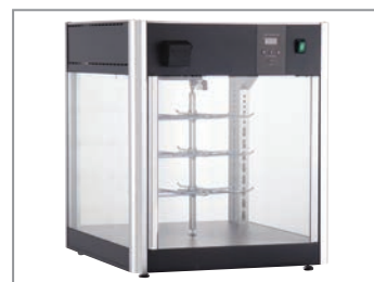
EDM-1K with Pretzel Rack