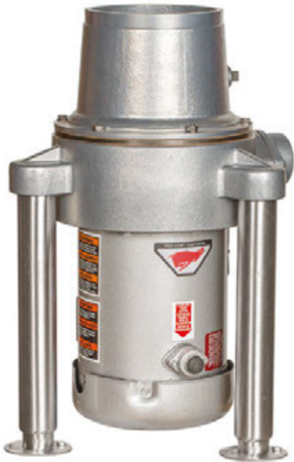
"A" Series Regular Design 7" Throat Size (Shown) Also available with: 4.5" Throat Size or Offset Design with 7" Throat