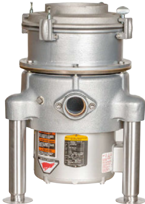
"B" Series Regular Design 7" Throat Size (Shown) Also available with: Offset Design with 7" Throat