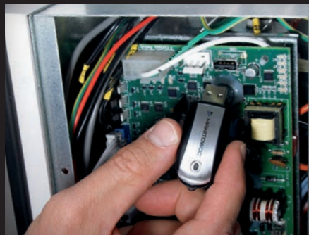
USB Port Firmware Updates