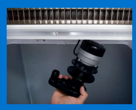
Snap-fit water pump