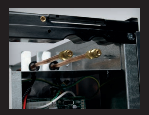
Easy Frontal Service Access Ports