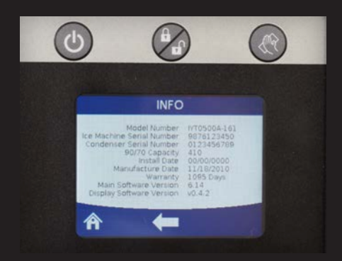
One touch machine info