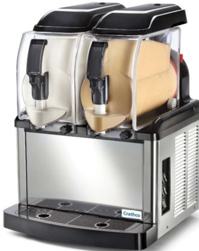
Model SP 2