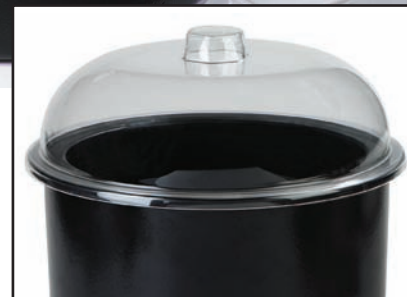
Coldmaster Ice Cream Server now come with a polycarbonate Lid to help maintain cold temperatures even longer