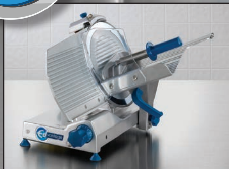
EDV-12C 12" Compact