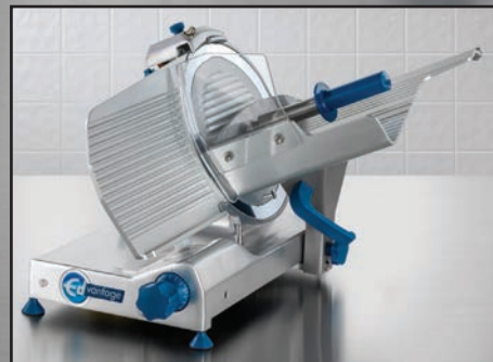
EDV-12 12" Medium Duty