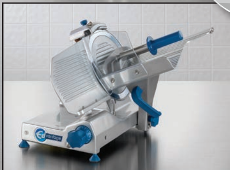
EDV-10C 10" Compact