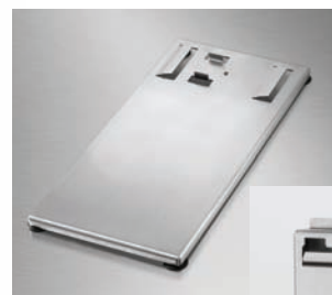
Suction Cup Table Base