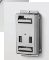
Quick disconnect wall mount bracket