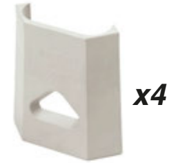
Replacement MetroMax i Wedges Cat. No. MX9985 Bag of 4 wedges